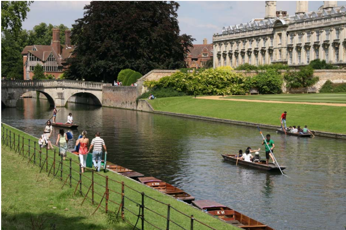
Punting on the River Cam along the Backs of the university colleges

A chauffeured punt tour is an essential part of the Cambridge experience. The punt tour that we have arranged takes you through the Backs along one of the most beautiful lengths of river in England. Lay back and enjoy the spectacular views of the mix of medieval and modern buildings whilst your chauffeur brings the story of both the city and the university to life.